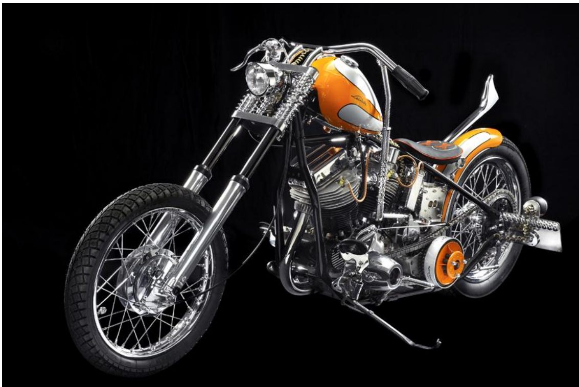
Suggestion for Caption The Leistritz XX-Trusion Harley Davidson